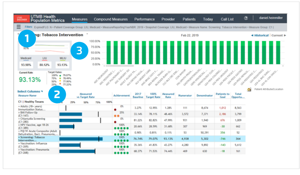
Figure 1: Community Care Advanced Application visualization